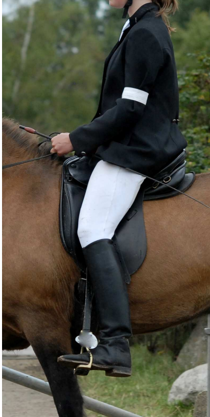
Correct seat in tolt: the rider sits vertically with an imaginary correct line from the shoulder to the hip to the heel; she is relaxed and balanced

By Tina Pantel / Translation: Christiane Soeffner