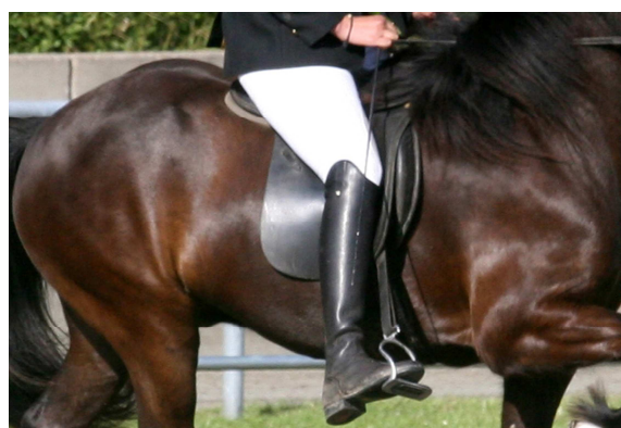
Seat back, legs forward: here we see a show version of the old tölt seat.

four beat, Icelandic horses should be well able to go supple and with cadence and contact. Only horses that are accepting of all basic aids correctly will be able to accept the fine aids necessary for tölt. The horse raises up a bit in the front but still also gives at the poll. The four-beat tölt should flow through the horse's body like a wave. The tail is relaxed and bobs back and forth – that's the ideal. And the gait has addictive tendencies: if you ever managed to fly across the trails on a well schooled tölt, you will not be able to lose the grin off your face.