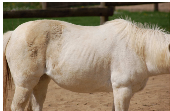
If a horse keeps getting thinner, this can hint at a health problem, like for example a metabolic disease.

Once underweight persists (resulting from under- or malnourishment), deterioration of performance, deficiency symptoms (visible for example on hoofs and coat), low immunity and susceptibility to infections threaten. Overweight stresses - like in humans - joints, circulation, breathing and single organs, lowers performance and fertility and increases the infection pressure.