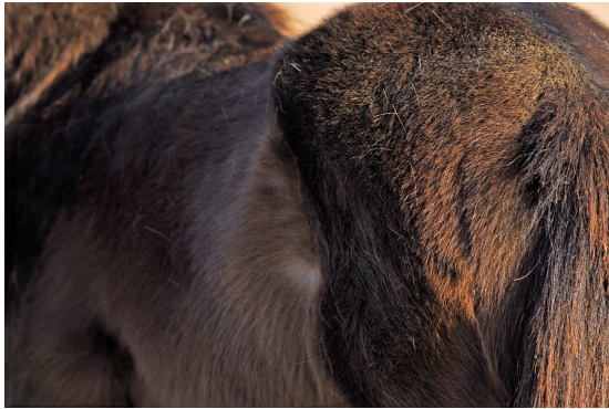
Thick winter coat can obscure the real nutritional and physical condition.

"A thick belly does not make a thick horse", Ines Fischer of the Mobile Horse Weigh clarifies. This was a typical misbelieve. "The abdominal girth can vary strongly depending on the amount of intestinal contents, especially after pasturing it contains up to 60kg of grass..." In addition a badly trained abdominal musculature or the fluffy winter coat of robust horses can distort the appearance in the abdominal region.